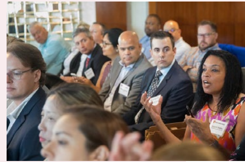
AHLA members attending the inaugural summit