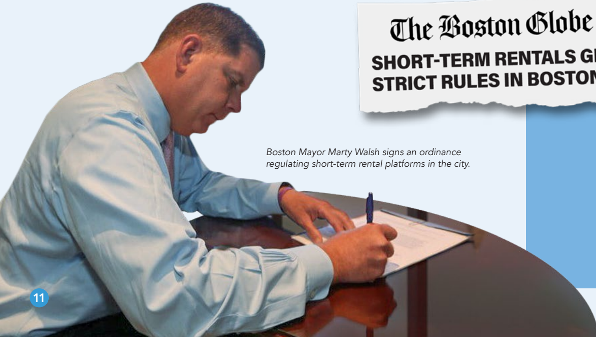
Boston Mayor Marty Walsh signs an ordinance regulating short-term rental platforms in the city.

We are taking the fight against illegal hotels across the country, and we're winning. Illegal hotels use short-term online rental platforms such as Airbnb to avoid paying taxes and circumvent neighborhood zoning and rent control laws. In 2018, we scored significant wins by helping legislation and enforcement efforts advance in New York, Boston, San Diego, Washington, D.C. and Los Angeles curtailing the growth of illegal hotels while setting a precedent for other local communities across the country to follow. With the support of AHILA members, partner state associations, neighborhood activists and labor groups, cities are taking on companies like Airbnb and putting local residents first.