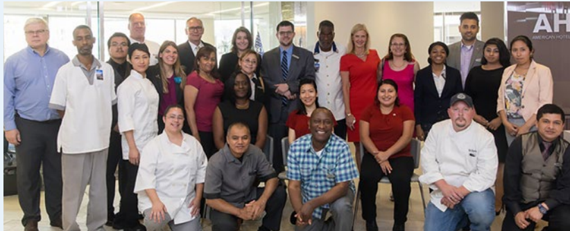
Hotel industry associates visit AHLA headquarters before the White House announcement on apprenticeship.

While in 2017 we launched an apprenticeship program, in 2018 it really took off. To address the industry wide need for managers and supervisors, AHLEF's apprenticeship program grooms young talent for management positions. In 2018 AHLEF enrolled 400 apprentices in more than 35 states across the country for over (25) different employers.