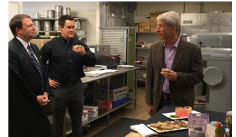
Rep. Kurt Schrader (D-OR) at the Hilton Portland and Executive Tower in Portland, Oregon