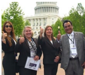
AHLA and AAHOA Members on Capitol Hill