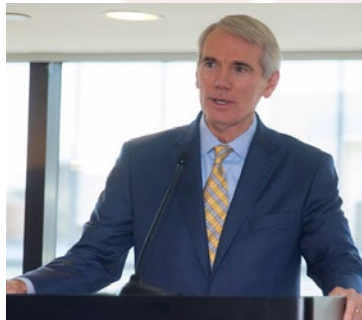
Senator Rob Portman (R-OH)