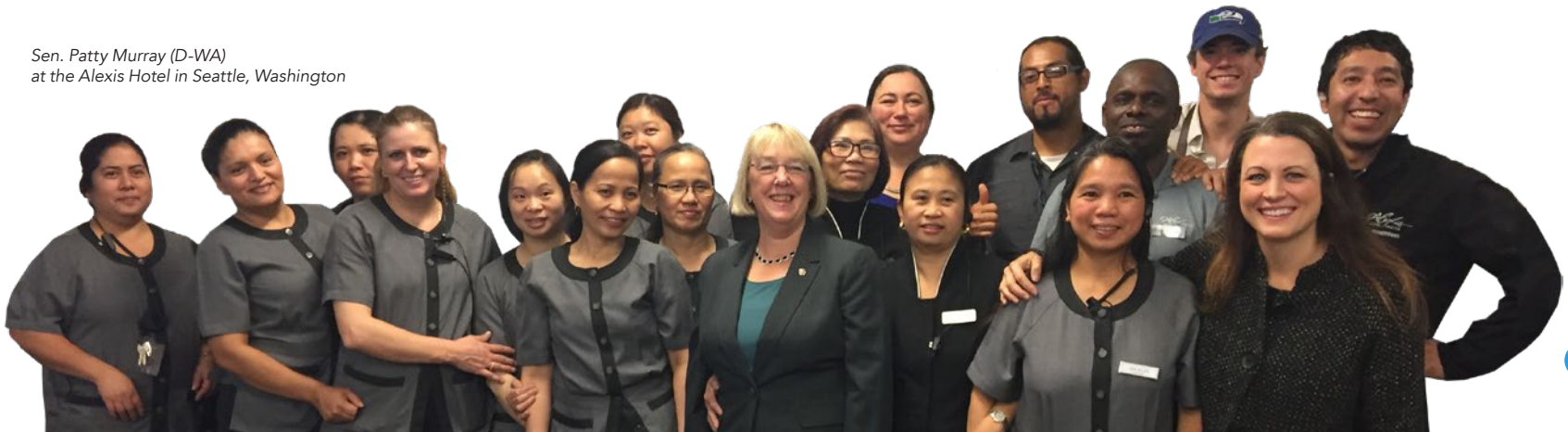
Sen. Patty Murray (D-WA) at the Alexis Hotel in Seattle, Washington

Giving tours of local hotels to Members of Congress is an AHLA tradition. In 2018 we gave more than a dozen tours. These tours provide Members of Congress an inside view of what makes our industry so dynamic: our people. By sharing the individual stories of the staff and the history of the hotel, we put a name to the face of our industry for Members of Congress—helping to hit home the positive impact we have in creating jobs and serving our communities.