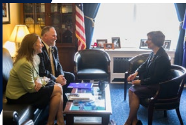
Rep. Suzanne Bonamici (D-OR)

Nearly four hundred AHLA and AAHOA members descended on Capitol Hill for the 2018 Legislative Action Summit to share their stories with members of Congress. With more than 230 meetings with Members of Congress and staff, we showed the strength, size and diversity of our industry while highlighting the vast opportunities our industry provides. LAS attendees educated congressional offices on policies that will help grow our industry such as supporting international tourism, and new protections against online booking scams for consumers. LAS attendees also heard presentations by key leaders in Washington including U.S. Department of Labor Secretary Alexander Acosta; Sen. Mike Rounds (R-SD); Reps. Henry Cuellar (D-TX), Rodney Davis (R-IL), Scott Peters (D-CA); and Deputy Assistant Secretary for the National Travel and Tourism Office Phil Lovas.