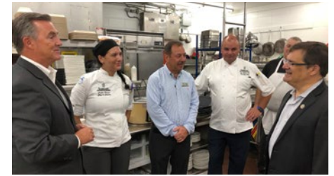
Rep. Gus Bilirakis (R-FL) at the Innisbrook Resort in Palm Harbor, Florida