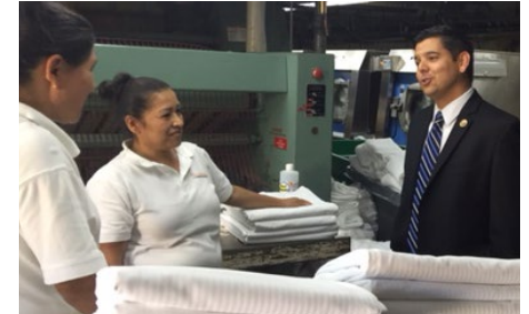
Rep. Raul Ruiz (D-CA) at the Hilton in Palm Springs, California