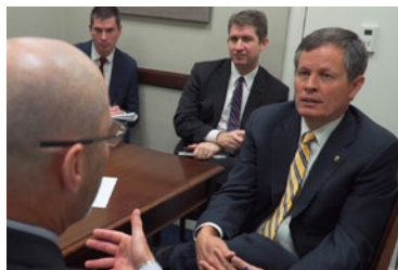
Sen. Steve Daines (R-MT)