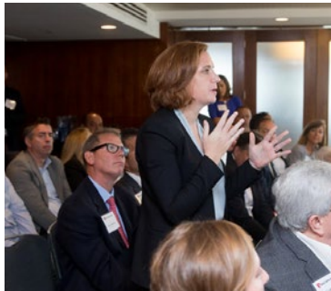
Q&A at AHLA's Safety Summit